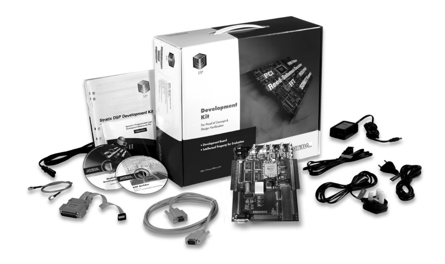
Figure 1–1. Stratix DSP Development Kit Contents