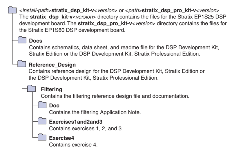
Figure 2-1. Stratix DSP Development Kit Directory Structure