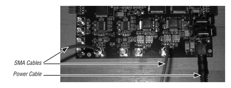
Figure 2-4. Connect the SMA Cable to the EP1S25 Development Board

For the Stratix EP1S25 development board or the Stratix EP1S80 development board, connect both ends of the SMA cable to the board. This cable connects the digital-to-analog (D/A1 or D/A2) and analog-to-digital (A/D1 or A/D2) connectors on the board. See Figure 2–4.